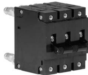
AM1P Series Circuit Breaker

The AM1P breaker is designed for telecommunication sites with high current demands and limited space. With a 250 ampere current carrying capacity and improved interrupting ratings up to 50 kA, the AM1P breaker gives unparalleled performance in site applications. The AM1P series is UL 489A listed.