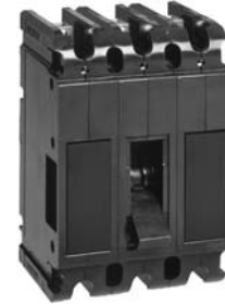
GH Series Circuit Breaker

The GH Series offers all of the advantages of a completely magnetic 3-pole breaker with a 14,000 ampere interrupting capacity. Perfect for applications in extreme environments where thermal-magnetic breakers would have otherwise been selected. The GH breaker is UL listed (489/508) for branch circuit applications.