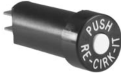
KD Series Pushbutton

A low-cost pushbutton supplementary protector for electrical equipment. Designed to fit a standard 5/8" round or "D" shaped panel cutout. With a variety of accessories, the KD Series is a perfect replacement for traditional panel-mounted fuse holders.