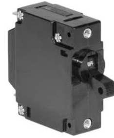
J Series Circuit Breaker

Small lightweight hydraulic-magnetic circuit breaker perfect for telecom and marine applications. Available in ratings from 0.1 – 50 amperes, the J Series offers a variety of options including snap-in mounting and rocker style handles. The compact size of the J Series makes it well suited for applications where space comes at a premium.