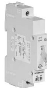
SPHM Series Circuit Breaker

The SPHM Series Circuit Breaker snaps easily onto a standard 35 mm DIN rail. This saves valuable installation time. Available with a wide range of accessories, the SPHM Series is the perfect alternative to DIN-rail mounted fuse blocks.