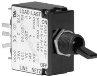
PROPAK Series Circuit Breaker

Miniature single- or 2-pole circuit breaker available with paddle or rocker handle. Available with or without illumination and a variety of internal accessories including auxiliary switches and remote tripping options. Carries UL 1077, CSA and VDE approvals.