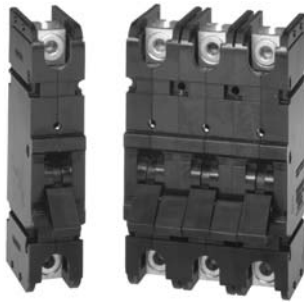
GJ Series Circuit Breakers

High-current circuit breakers in a compact package, the GJ Series offers protection up to 250 amperes. Add the precision of hydraulic-magnetic protection on your critical loads over 100 amperes.