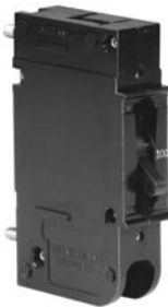
C Series Circuit Breaker

High-current circuit breaker for single- or multi-pole applications, the C Series is one of Eaton's most versatile breakers. With a 600 Vac rating and the ability to select from a variety of trip curves, the C Series is an alternative to thermal-magnetic breakers in harsh environments or when precision is essential.