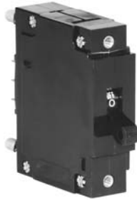
AMR Series Circuit Breaker

Ultra-high interrupting circuit breaker for single- or multi-pole applications. The AMR Series delivers significant performance advantages in a compact package. Available as a UL 489 listed device, suitable for branch circuit protection, the AMR can be used in a wide variety of applications, including lighting and power distribution equipment. Also carries UL 1077, CSA and TUV approvals.